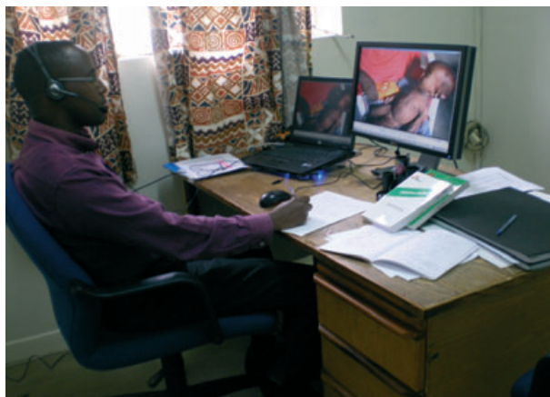
Figure 1 Consultation room and specialist paediatrician in Nairobi, Kenya conducting a telemedicine consultation with colleagues in Guri'el hospital, Somalia.

who spoke the Somali local language to counsel parents of very ill children, thereby fostering a positive relationship between the clinical team and parents. Paediatric management was in line with WHO and MSF clinical guidelines (MSF 2010).