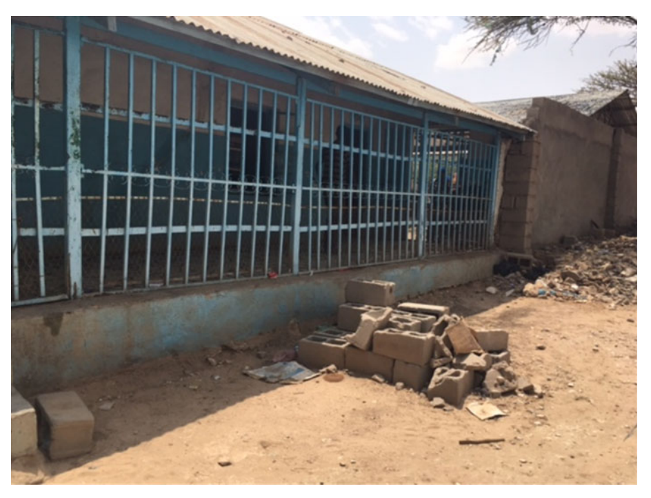
Fig. 1 Entrance to Mental Health Department, Hargeisa Group Hospital, Hargeisa, Somaliland.